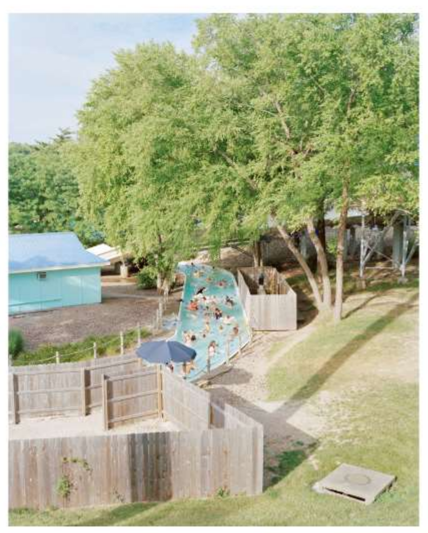
Quawin of Fun