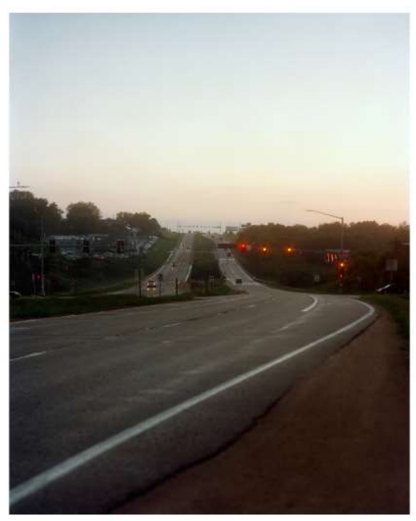
Dolongue par 31