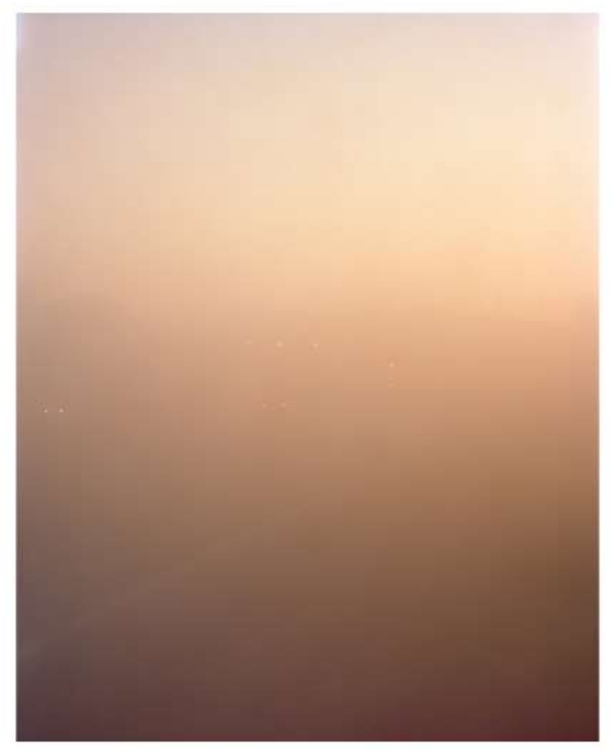
Dobuque (no 02)